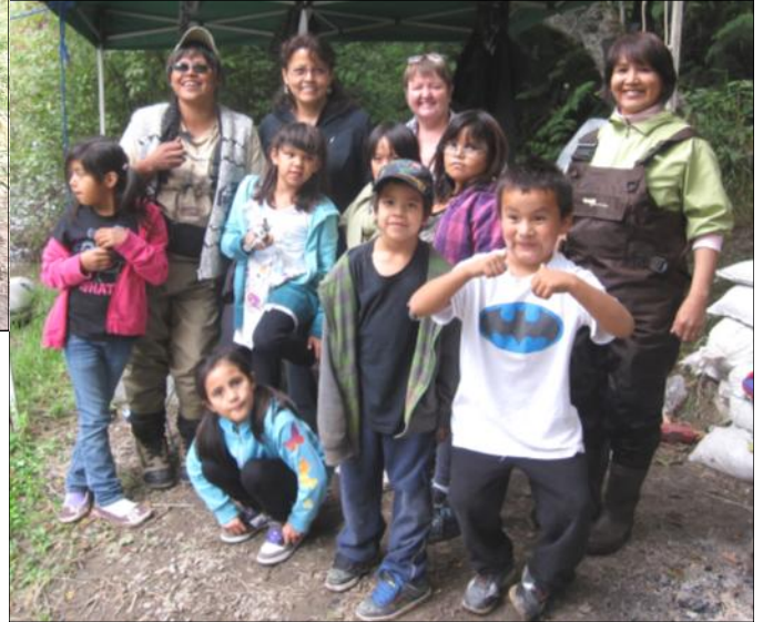
Grade Three Class Visiting at the Fish Counting Fence September 2011